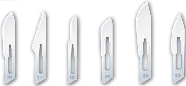
N° 10 N° 11 N° 15 N° 20 N° 22 N° 23 LUSD10 LUSD11 LUSD15 LUSD20 LUSD22 LUSD23