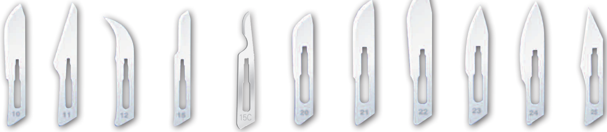
N° 10 N° 11 N° 12 N° 15 N° 15C N° 20 N° 21 N° 22 N° 23 N° 24 N° 25 LUSB10 LUSB11 LUSB12 LUSB15 LUSB15C LUSB20 LUSB21 LUSB22 LUSB23 LUSB24 LUSB25